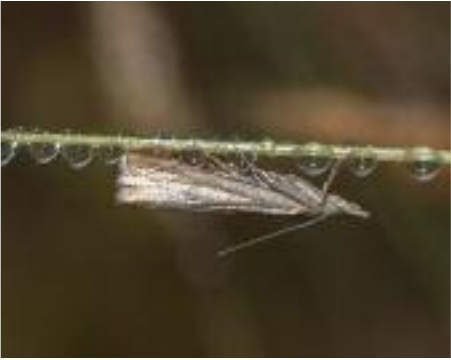
Above: Common grass moth Chrysoteuchia culmella Top: Caterpillar of the 'The Drinker' Moth

The results demonstrate the excellent progress that continues to be made in the NCA and reflects how industry and nature are able, not only to exist, but thrive together, side-by-side.