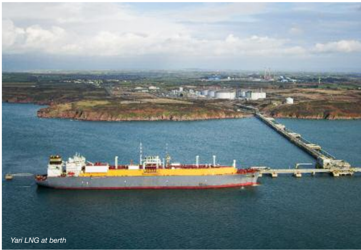
Yari LNG at berth

Welcoming our first cargo from the US, marking an important milestone at the Terminal.