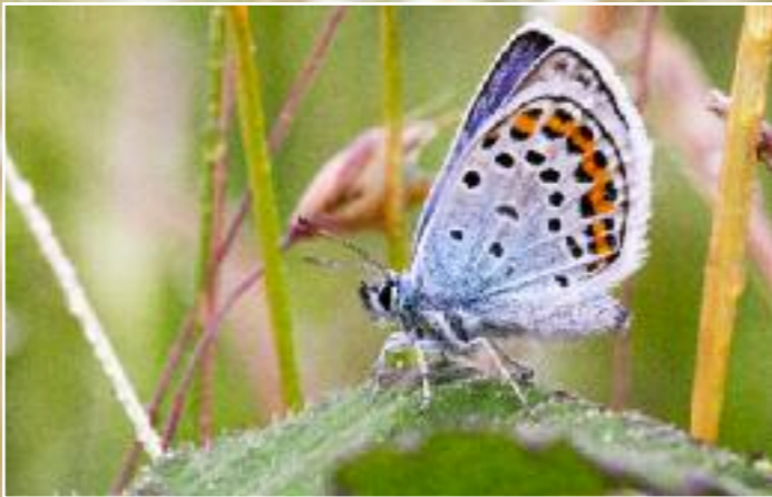
Silver-studded Blue Butterfly

The Biological Recorders were very complimentary about the conservation monitoring and 'low key' management activities that we have implemented. They also commented on how the biodiversity of habitats within the NCA have developed and been encouraged since the last large scale biological monitoring exercise, conducted in 2010. The latest recordings of species and habitats will help inform and shape future monitoring and management activities moving forwards.